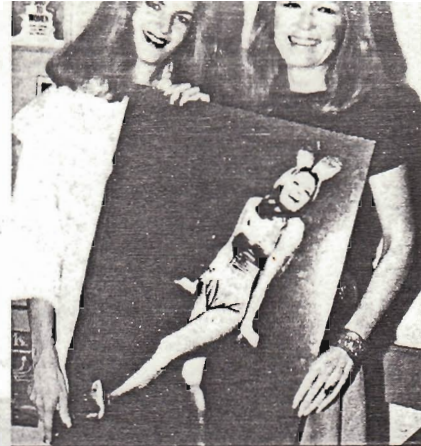
Actress Alley and Steinem join forces to expose bunnydom.

Each book of the series is a bedtime story for adults, recalling the feelings of childhood—the smell of burning leaves in the fall, the first school play you had to suffer through—all told through the eyes of a grown-up who makes fun without ever being mean. Published by Apple-wood Books, $4.95 per installment.